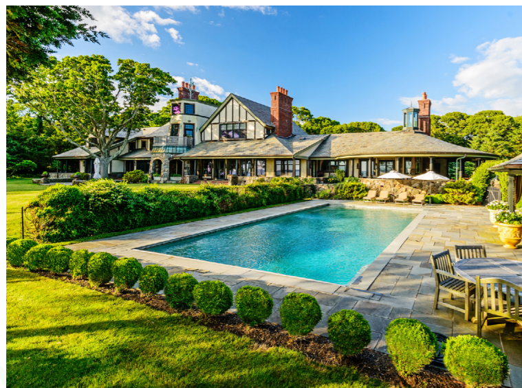
Sotheby's International Realty-Southampton Brokerage in New York recently sold this stone and stucco mansion for $31,750,000

Harald Grant of Sotheby's International Realty-Southampton Brokerage in New York recently sold a circa 2005 Lutyens-inspired stone and stucco mansion for $31,75 million . Perfectly positioned on six acres of waterfront property with a deep water dock, the 10,000 square foot house has well-proportioned rooms including a formal living room and gathering room, both with stone fireplaces, and circular alcove. The house is complete with a paneled billiards room with fireplace, a fully-appointed media room, reading room, gym, a chef's dream kitchen and formal dining room. There also are seven fireplaces, an elevator, six bedrooms and eight bathrooms. An extensive covered terrace, with year-round stone hot tub, overlooks the heated Gunite swimming pool and 350 feet of beachfront. There are also tennis and basketball courts and a separate four-car garage.