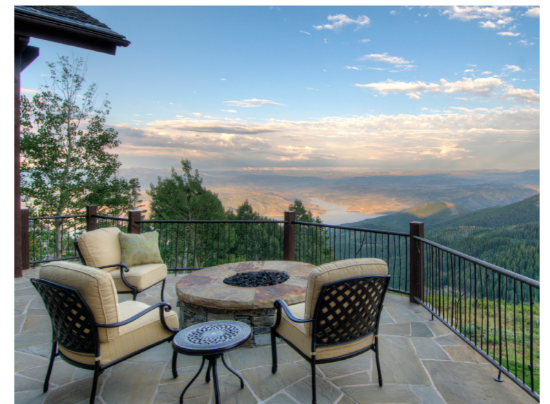
Summit Sotheby's International Realty recently sold the former home of TV producer Marcy Carsey for $12.5 million