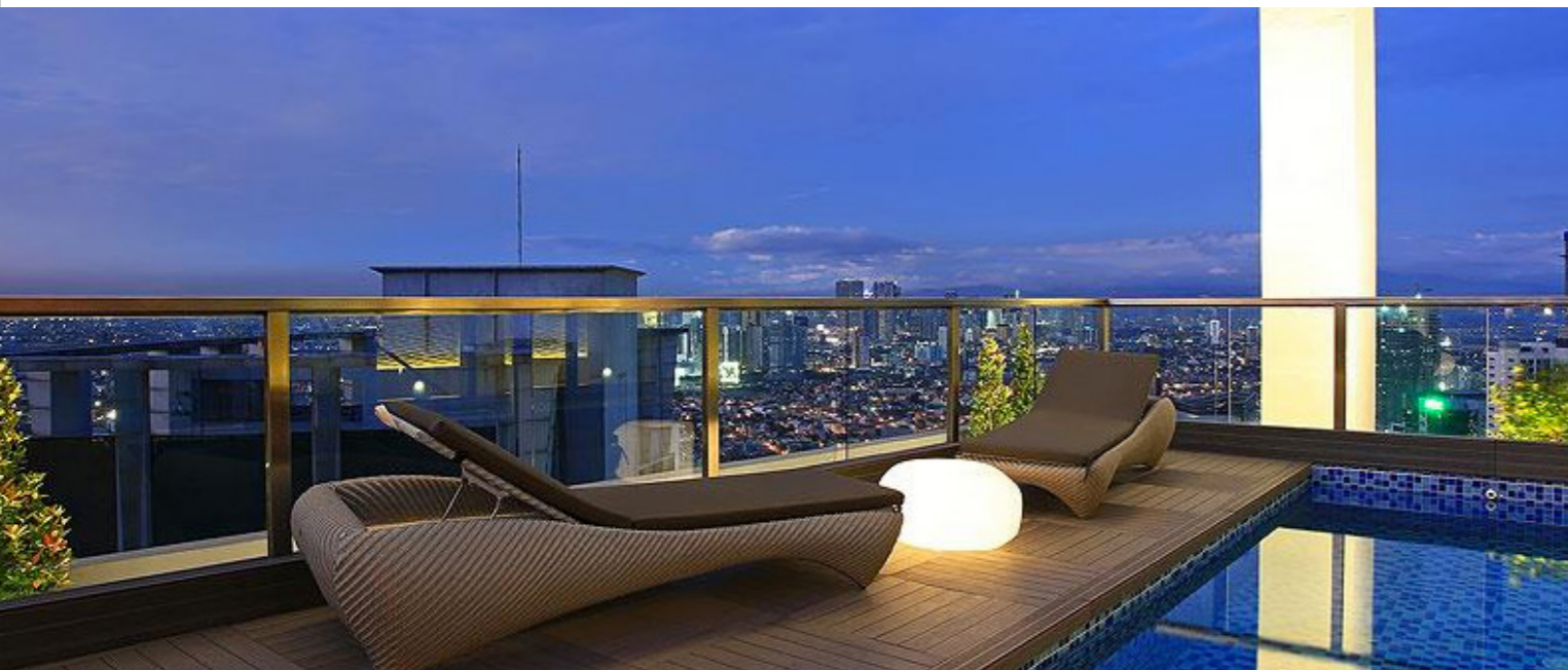
Phillipine Sotheby's International Realty | Forbes Town Center, Taguig, Phillipines | Price Upon Request Property ID: PSV7F4

THE PHILIPPINES – "Building on strong internal growth, driven by people with wealth that are investing in the country, the future in the Philippines' real estate sector is bright. The alliance with the Association of South East Asian Nations (ASEAN) region makes the country an attractive investment destination. Due to the nation's strong economic growth from BPO (Business Process Outsourcing), off shoring industries, an increasing number of visitors and remittances from overseas Filipino workers and a young demographic, the Philippines is considered the prime option for residential, commercial and retail sectors. Our luxury residential market has been receiving more foreigner buyers as neighboring Asian countries implement cooling measures. Another trend we are seeing is Filipinos and foreigners are looking into countries for retirement. The climate, lifestyle, the people... easy living makes investing in real estate in Philippines more appealing as the value of their money goes a long way."