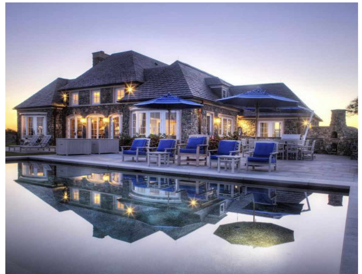
Gustave White Sotheby's International Realty | Newport, Rhode Island | $45,000,000 (USD) Property ID: JE8MHF

Kathleen Greenman and Michelle Kirby of Gustave White Sotheby's International Realty in Newport, Rhode Island have listed a 45-acre oceanfront estate that anchors the southern point of Newport's celebrated Ocean Drive. Listed for $45 million , the home offers breathtaking vistas that span from the greens at Newport Country Club, across acres of rolling lawns to the spectacular southern ocean views. Amenities include an infinity-edge pool, private water frontage and a mooring on Price's Neck Cove. A 3,576 square foot, three-bedroom guest cottage is nestled into the landscape and shares similar stunning views. For more information, click here .