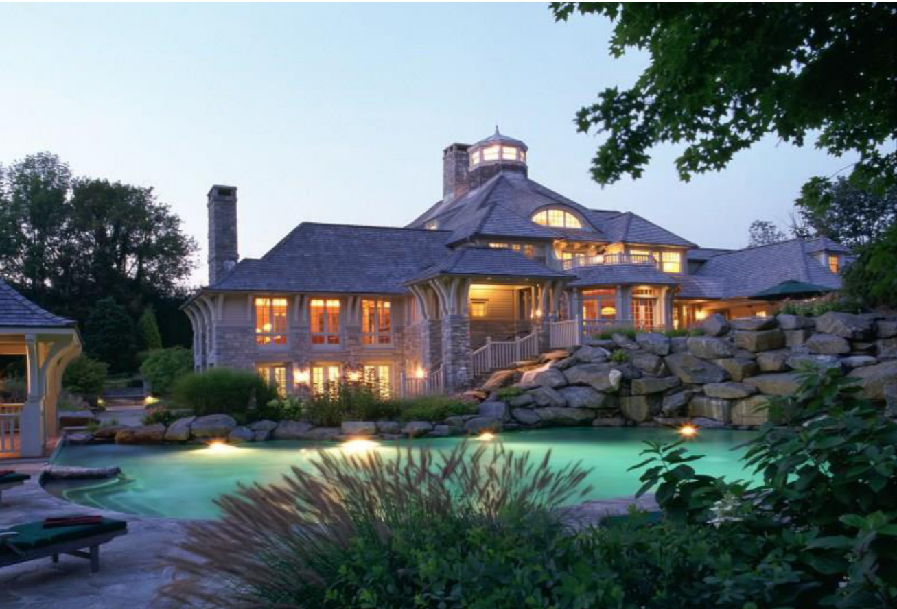
Sotheby's International Realty – Greenwich Brokerage | Greenwich, Connecticut, USA | $14,000,000 Property ID:W944G7