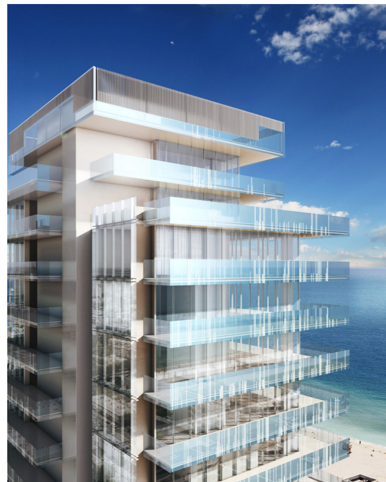
ONE Sotheby's International Realty recently sold this $20 million penthouse

Eloy Carmenate of ONE Sotheby's International Realty in Florida has sold a three-level penthouse for $20 million . Set on over 7,000 square feet, the property offers unmeasurable luxury. There is a plunge pool on the 17th floor and a full-floor master suite on the 18th floor. This penthouse truly embodies an elegant and indulgent lifestyle.