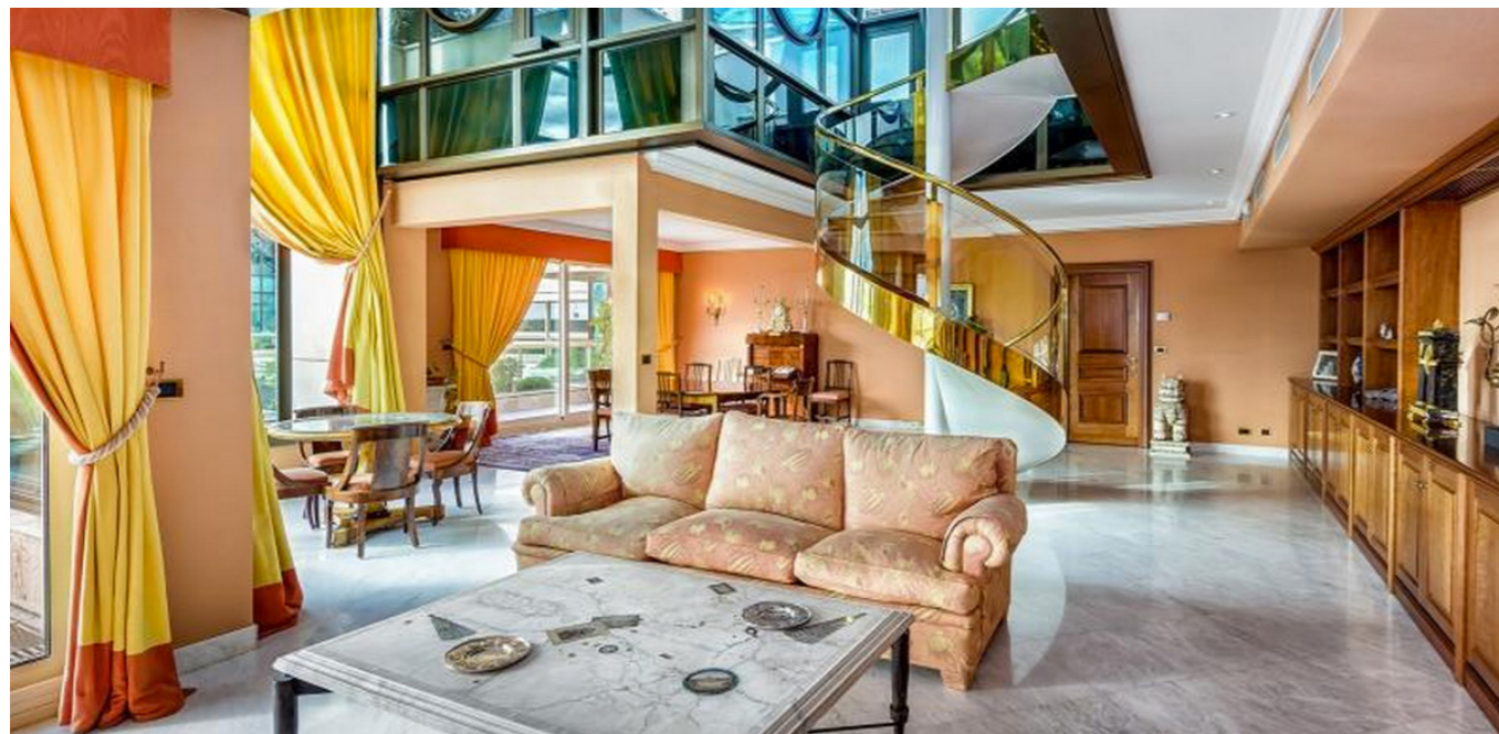
Sotheby's International Realty France Monaco | Monte Carlo, Monaco | Price Upon Request | Property ID: NW472B

MONACO — “There are few real estate markets in the world that can compare to Monaco in terms of glamour, price and quality of life. The casino of Monte Carlo, its annual Formula 1 Grand Prix, the world’s biggest mega-yachts, Grace Kelly and Monaco’s unique tax advantages (no taxes whatsoever for residents) are legendary. Add to that its enchanting location on the French Riviera, year-round sunshine, virtually no crime and some of the world’s best shops, hotels and restaurants, and the mixture becomes truly unique. Not surprisingly, Monaco has attracted the rich and beautiful for more than a century; in combination with very limited housing supply (the entire country’s size is less than two square miles), this has created some of the world’s highest real estate prices. Following a slower period from 2011 – 2012, the year 2013 saw a renewed influx of ultra high net-worth individuals taking up residence in Monaco and thus revitalizing the local real estate market. It is virtually impossible to find anything for under € 20,000/square meters, and prices can exceed € 100,000/square meters for the most sought-after properties near the casino or the beaches. In a world troubled by economic and political unrest, Monaco continues to be a haven of peace for the lucky few.”