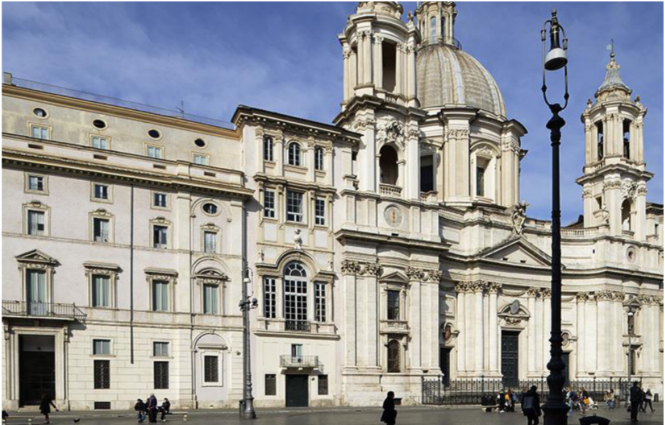
Tuscany Sotheby's International Realty | Rome, Italy | $11,146,278 (USD) 8,100,000 (EUR) Property ID:YCTMRV

Diletta Spinola of Tuscany Sotheby's International Realty in Italy has listed an $11.2 million (USD) residence that was featured in the Oscar-winning film “The Great Beauty.” Palazzo Pamphili, whose main floor houses this apartment, was built by Pope Innocent X between 1644 and 1650, patron of the new Baroque Piazza Navona. Over the centuries it has been home to many famous public figures including the Russian Tsar Alexander I in 1857 and the first floor became the home of the Philharmonic Academy of Rome. This sumptuous mansion is listed within the Italian cultural heritage. For more information, click here .