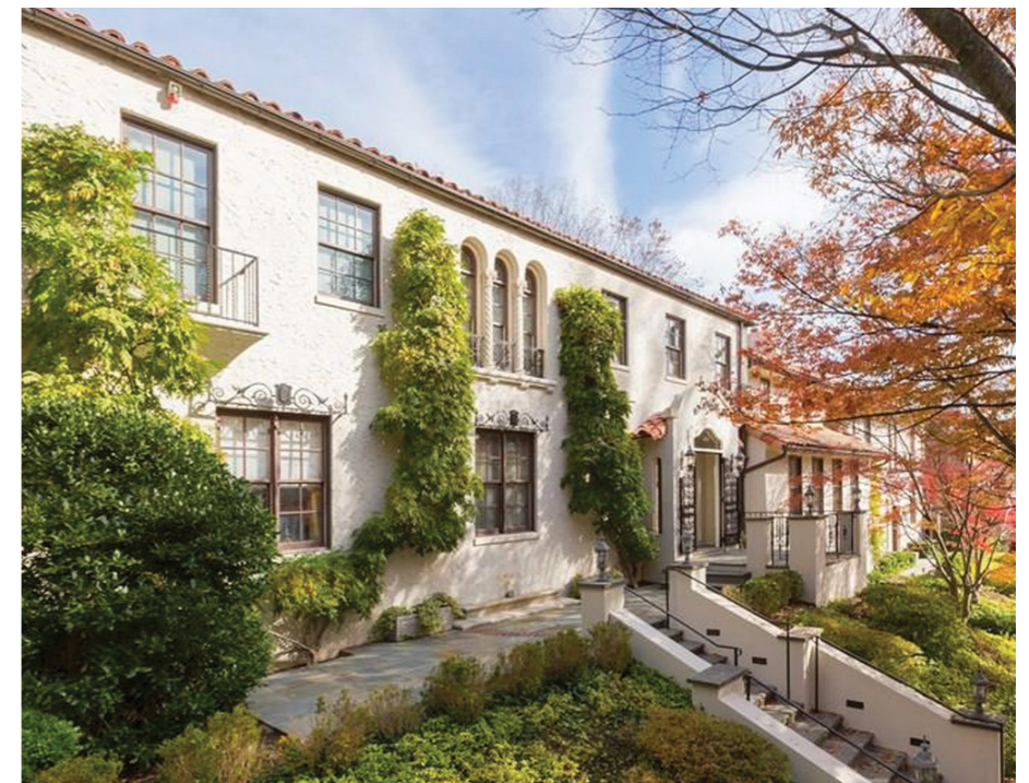
TTR Sotheby's International Realty | Washington D.C., USA | $9,800,000 USD Property ID: VMBJ2W