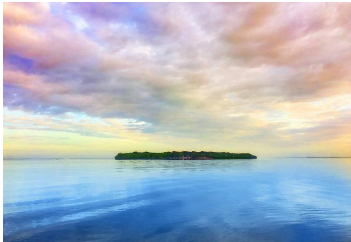
Russell Post Sotheby's International Realty | Private Island, Key Largo, Florida | $110,000,000 (USD) Property ID: GPS3Z5

Kathleen Greenman and Michelle Kirby of Gustave White Sotheby's International Realty in Newport, Rhode Island have listed a 45-acre oceanfront estate that anchors the southern point of Newport's celebrated Ocean Drive. Listed for $45 million , the home offers breathtaking vistas that span from the greens at Newport Country Club, across acres of rolling lawns to the spectacular southern ocean views. Amenities include an infinity-edge pool, private water frontage and a mooring on Price's Neck Cove. A 3,576 square foot, three-bedroom guest cottage is nestled into the landscape and shares similar stunning views. For more information, click here .